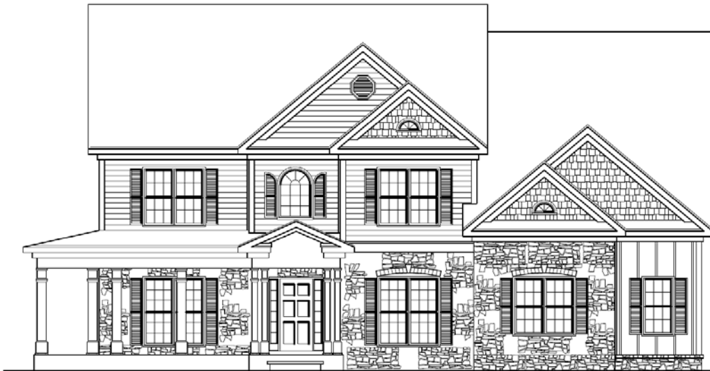
With Three Car Garage